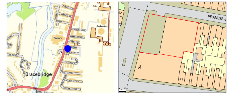
For indicative purposes only.