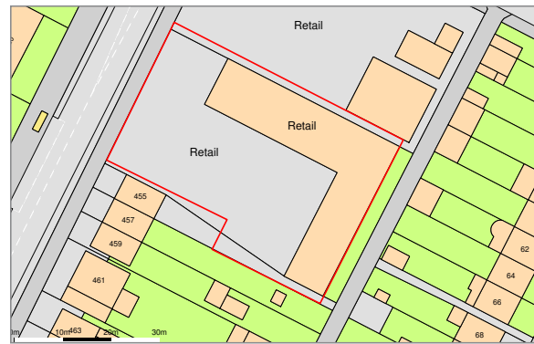
For indicative purposes only.