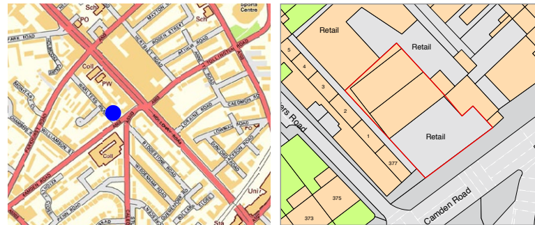
For indicative purposes only.