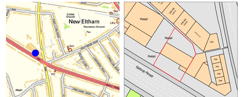
For indicative purposes only.