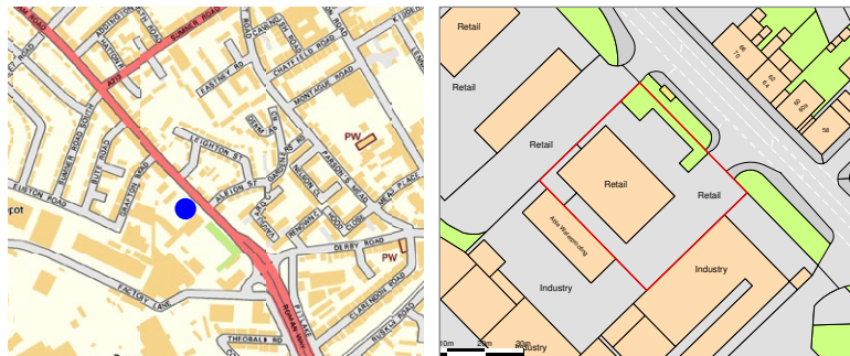
For indicative purposes only.