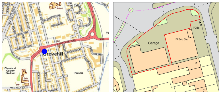
For indicative purposes only.