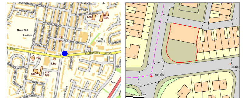
For indicative purposes only.