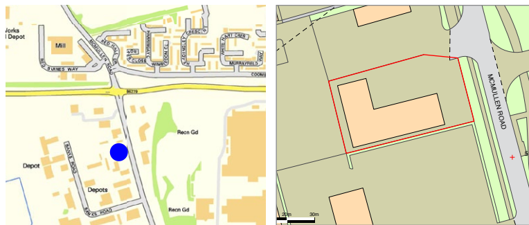
For indicative purposes only.