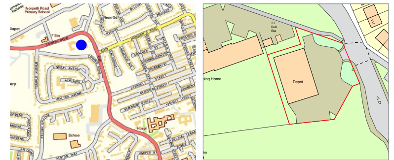
For indicative purposes only.